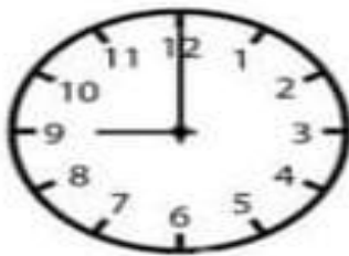
9:00 or 9 o' Clock

➤ Task 7: Write the time in two different ways: